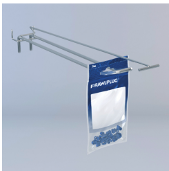
A (mm) 65 X 130

The bags are made entirely of low-density polyethylene, which makes them suitable for recycling and reduces the related purchase costs