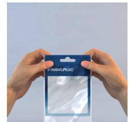
E (mm) 145 X 220