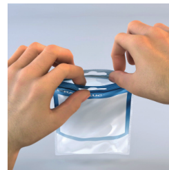
D (mm) 95 X 220