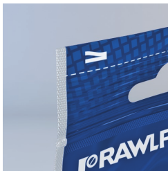
B (mm) 80 X 145