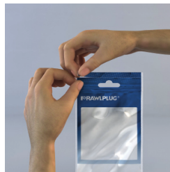
C (mm) 95 X 165